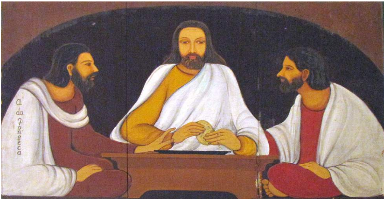
Breaking Bread , Unknown Artist, Christa Prema Seva Ashram (India)