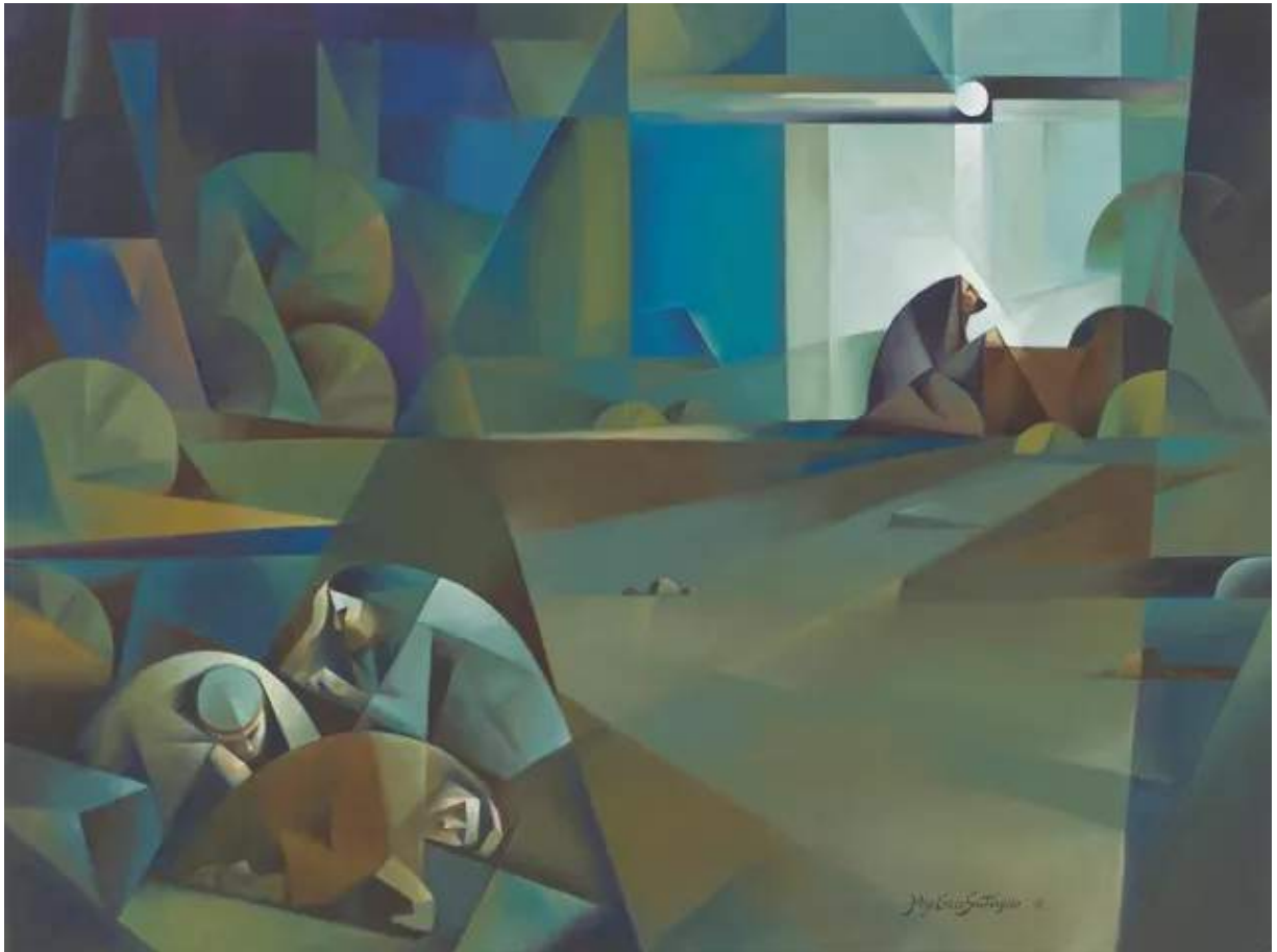
Abide with me , by Jorge Cocco Santángelo, 2019