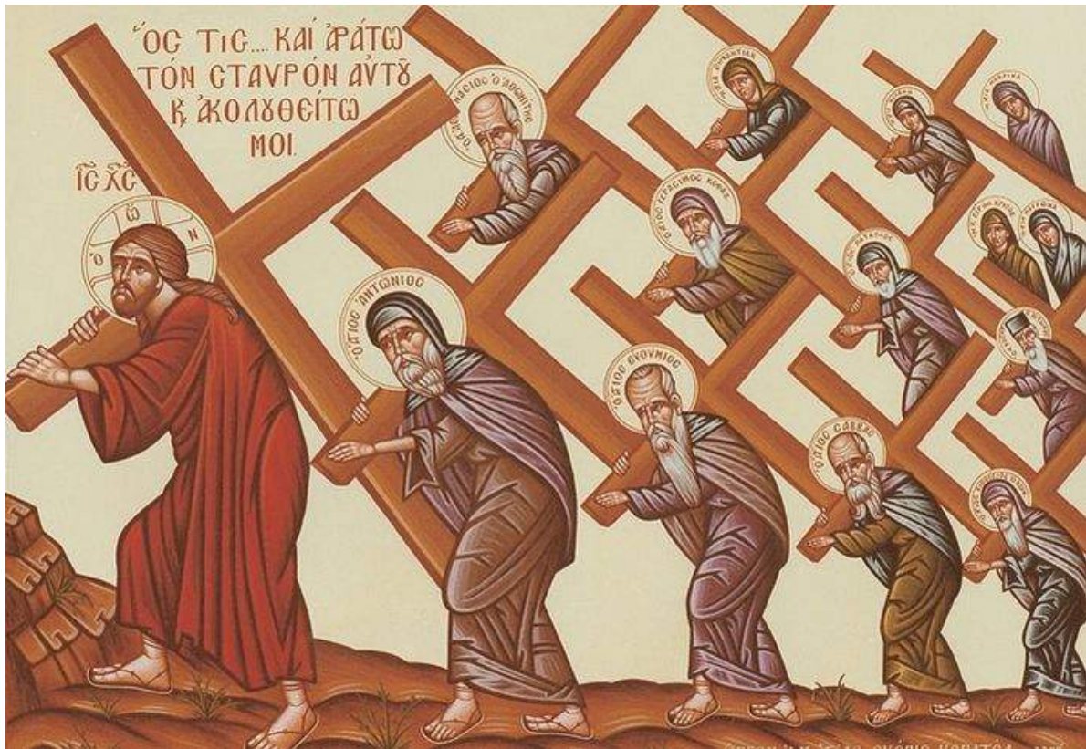
Icon, source unknown

HOLY EUCHARIST The Fourth Sunday after Pentecost June 25, 2023 11:15 AM